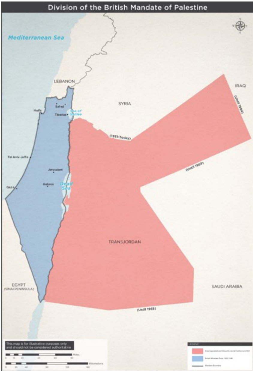
Map X. Division of the British Mandate of Palestine

III Indonesian Journal of International & Comparative Law 540-553 (June 2016)