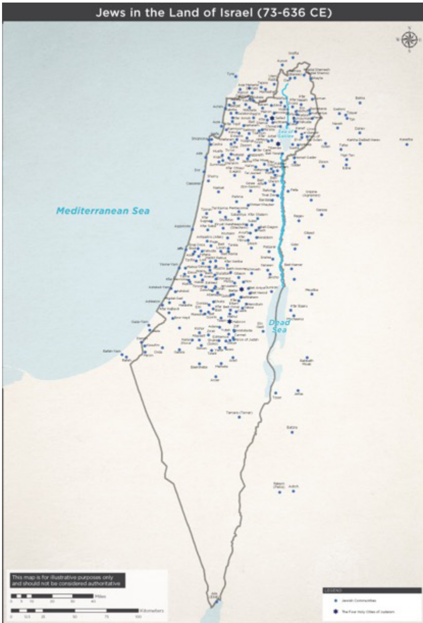
Map V. Jews in the Land of Israel (73-636 CE)