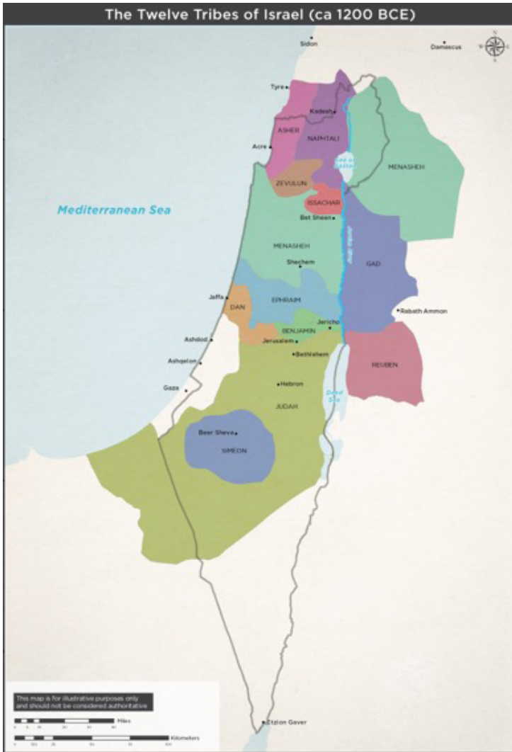
Map II. The Twelve Tribes of Israel (ca 1200 BCE)