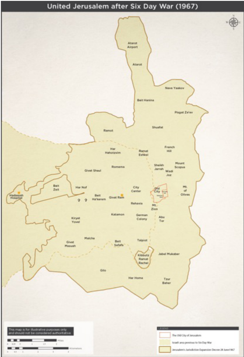
Map XIII. United Jerusalem after the Six Day War (1967)