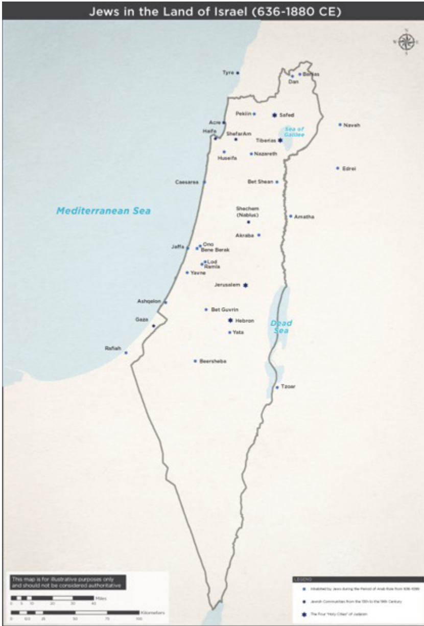
Map VI. Jews in the Land of Israel (636-1880 CE)

III Indonesian Journal of International & Comparative Law 540-553 (June 2016)