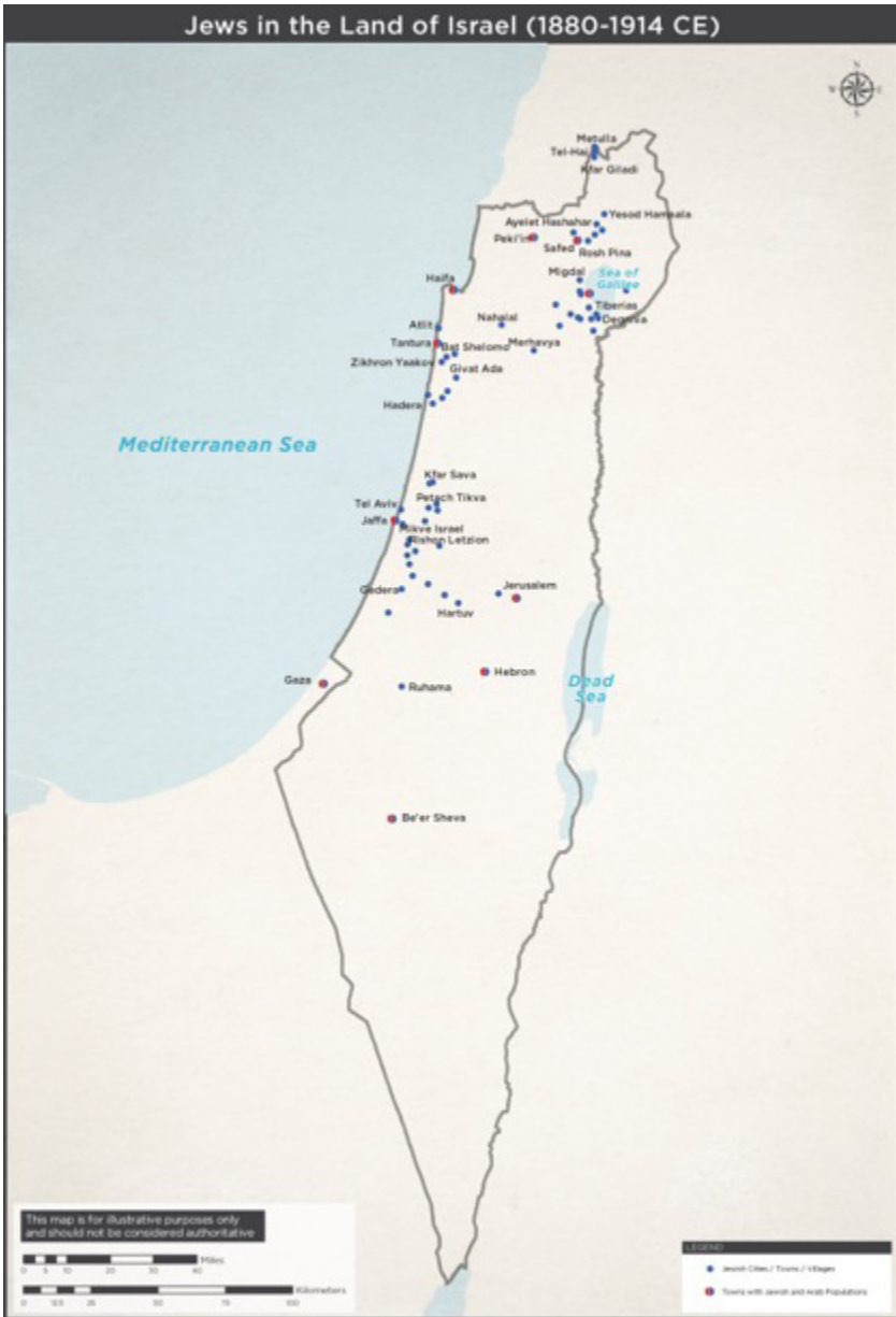
Map VII. Jews in the Land of Israel (1880-1914 CE)