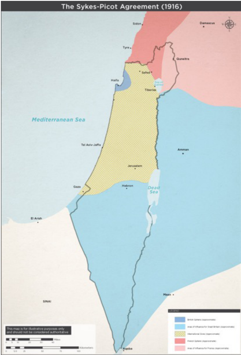
Map IX. The Sykes-Picot Agreement (1916)