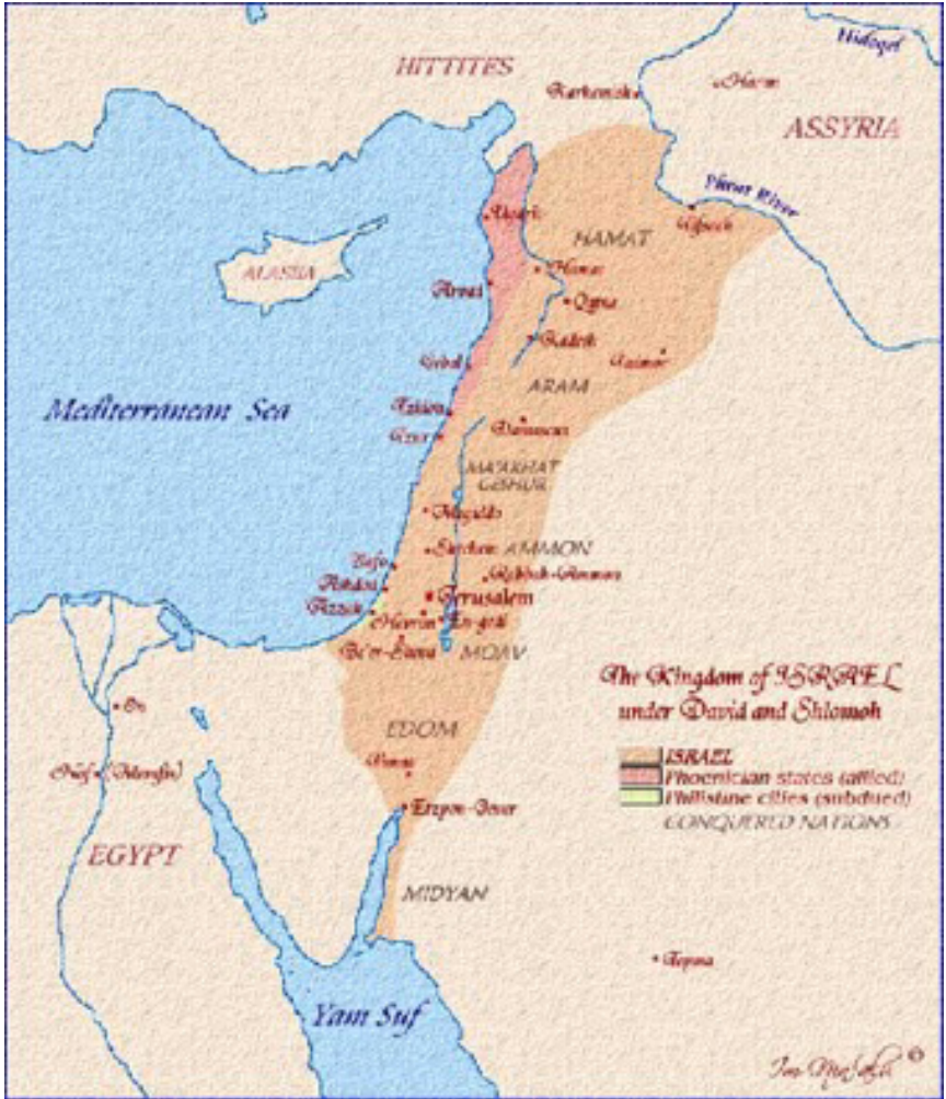
Map III. The Kingdom of David and Solomon