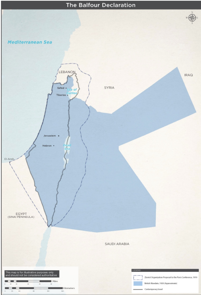
Map VIII. The Balfour Declaration

III Indonesian Journal of International & Comparative Law 540-553 (June 2016)